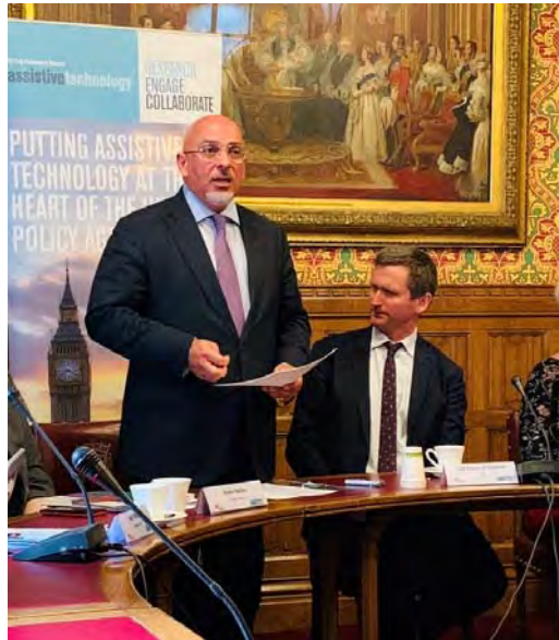
Minister for Children & Families, Nadim Zahawi MP, announces the AT Expert Group