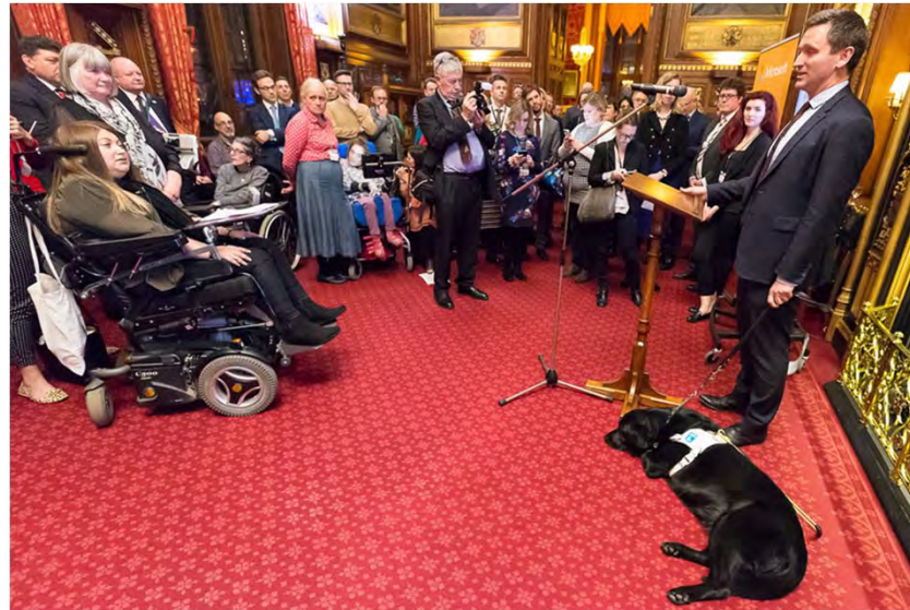
Launch of the APPGAT the Speaker's house