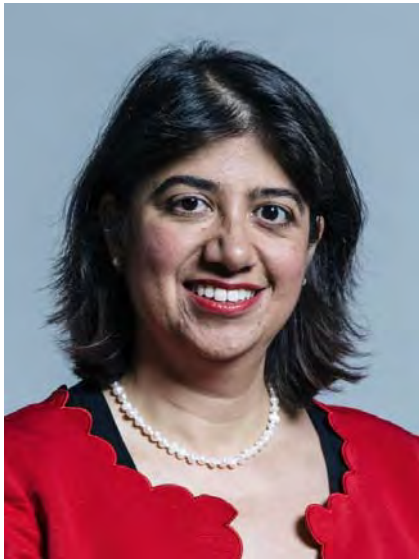
Seema Malhotra MP Co-chair of the APPGAT