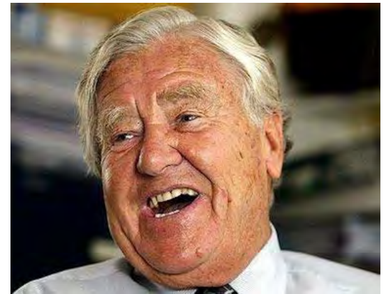
Alf Morris MP