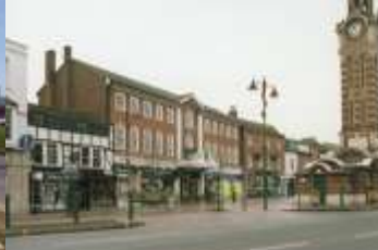
Ashford and St. Peter's